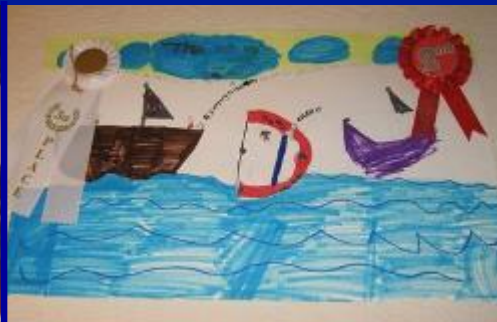
Derrika Bynam's D8 2nd & VB 3rd Place 6-8