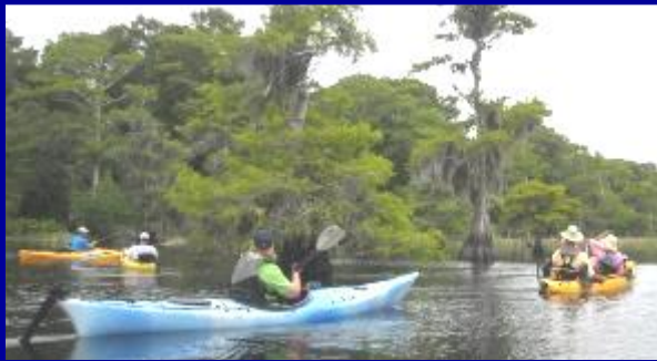
What a nice day! UH-OH, what's that behind us?