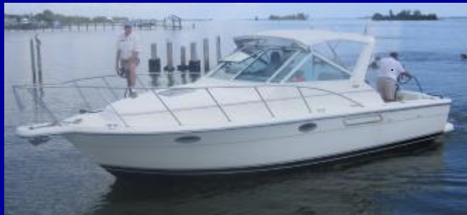
Old Squid Lips Photos