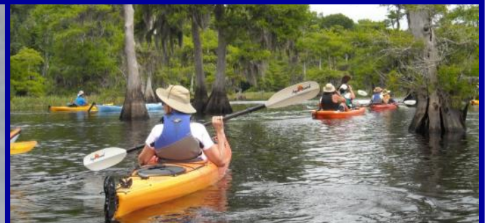
Heyguys,you might want to paddle a little faster-maybe alot