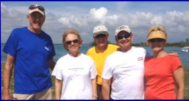
Bikers Taking a Break to Enjoy a Beautiful Day in Paradise