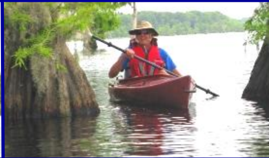
Hello! Anyone out there? I seem to be lost.