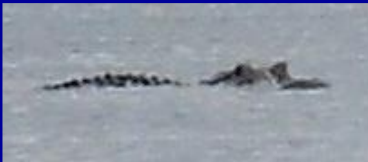
WOW! Look - a Smorgasbord on the Lake - My Lucky Day!!