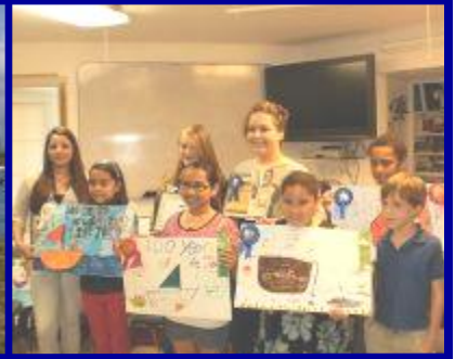
2013 VB & D8 Poster Contest Winners